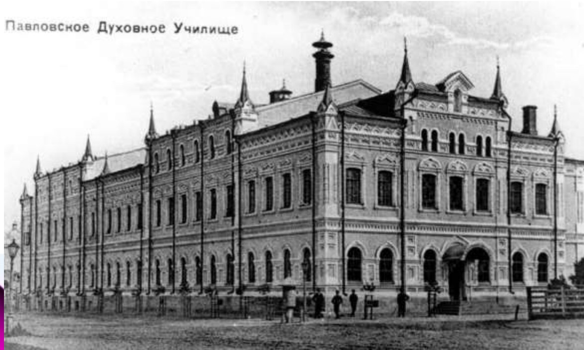
Павловское Духовное Училище

Pavlovsk technical school is located in the town Pavlovsk, the regional center in Voronezh region. Our was founded by Peter I in 1709.